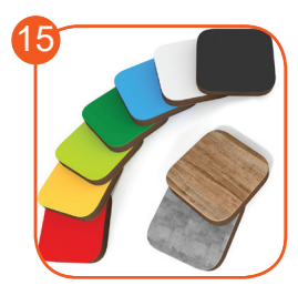
Safe pipe plugs made of injection molded polyamide.