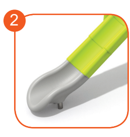
Modular polyethylene BUGLO slides made of rotomoulded LDPE type material.