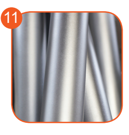
Solid construction made of stainless steel AISI 304 totally resistant to weather conditions. Solid construction made of stainless steel AISI 304 totally resistant to weather conditions.