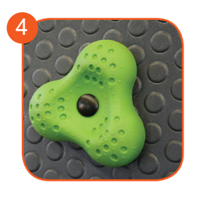
Climbing rocks made of chippings and colourful polyester resin.