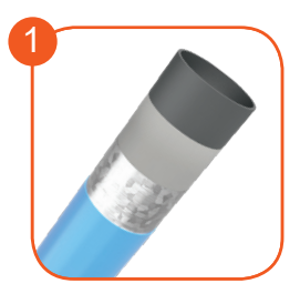
Solid construction made of black steel $235JR, cleaned in the sandblasting process. Protected against corrosion by galvanizing and powder coating with polyester paint QUALICOAT attested.