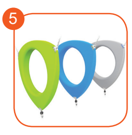
Ergonomically-shaped polyethylene rings improving the physical well-being and motor coordination.