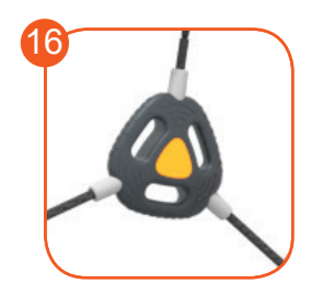
Handle made of rotomoulded LDPE type material.