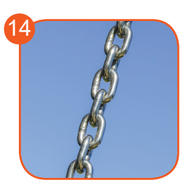
Attested 6 mm stainless steel chains.