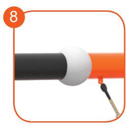
Tube covers made of injection molded polyamide.