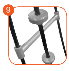
Rope ladder steps and rope knots made of injection molded polyamide.