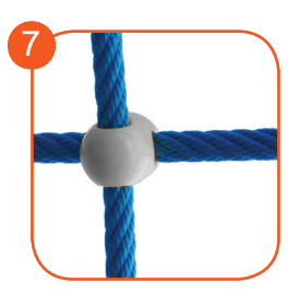
Solid and esthetic rope connectors made of injection molded polyamide.