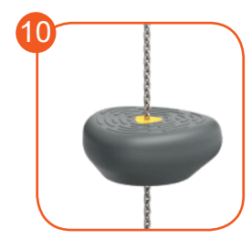
The passage module is made of a 6mm stainless steel chain, 15 mm thick HDPE boards and an 18 mm thick HDPE non-slip HDPE board.