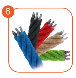
Polypropylene ropes ppmultisplit type with a steel core and a diameter of 16 mm.