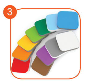
Plates of the walls made of colourful triple layered 15 mm HDPE polyethylene, in the highest quality, totally damp--proof and resistant to UV.