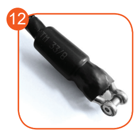
Ends of ropes clamped in sleeves made of durable aluminum alloys.