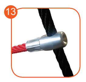
Rope endings pressed in a sleeve made of durable aluminum alloy.