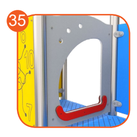
Passage module made of 15mm HDPE plate.