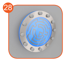
Rotary module, which allows to move the ball in the maze, made of HDPE plate, safe polycarbonate and stainless steel. Stimulates the sense of sight, the sense of space and teaches control of children energy.