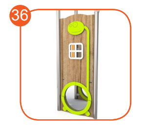
Passage module is made of 13 mm thick wood-like HPL, white and green 15mm HDPE boards and safe 8 mm thick polycarbonate.