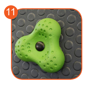
Plate and rope connectors made of injection molded polyamide.