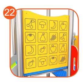
Milled educational board made of 15mm HDPE plate. Stimulates the sense of sight and teaches fast decision making.