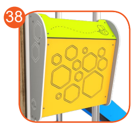
Balcony module made entirely of 15mm HDPE plate.