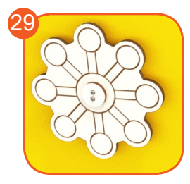
Rotary module, made of 13mm HPL plates. Stimulates the senses and supports the development of children motor skills. It stimulates the senses and support the development of children motor skills.