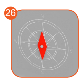
Milled educational board made of 15 mm thick HDPE board with a movable rotating element. It stimulates the senses and supports the development of children motor skills.