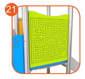
Milled educational board made of 15mm HDPE plate. Stimulates children senses.