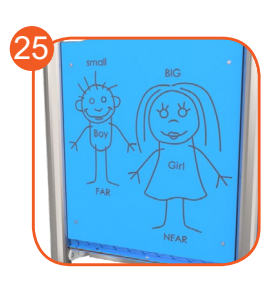
Milled educational board made of 15mm HDPE plate. It focuses attention.