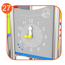
Milled educational board made of 15 mm thick HDPE board with a movable rotating element. Stimulates senses of sight, touch and focuses at-