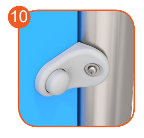
Plate and rope connectors made of injection molded polyamide.

Safe pipe plugs made of injection molded polyamide.