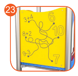
Milled educational board made of 15mm HDPE plate. Stimulates the sense of sight and focuses attention.