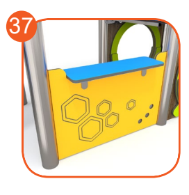
Counter module made of 15mm HDPE plate.