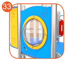
Hemispheric window with a diameter of 400 mm. Material: heat - formed polycarbonate 5 mm thick.