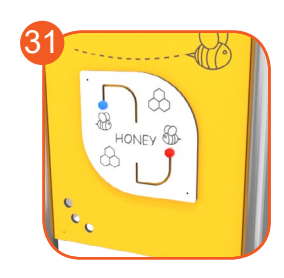
Module, which allows to move shapes on the milled tracks. Corrects visual- motor coordination. Made of 15 mm HDPE plates.