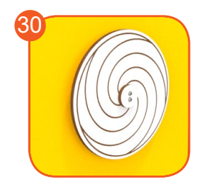
Rotary module, made of 13mm HPL plates. Stimulates the senses and supports the development of children motor skills. It stimulates the sense of sight and teaches control of children energy.