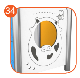
Milled educational board made of 15mm HDPE plate. It stimulates children senses and focuses attention.