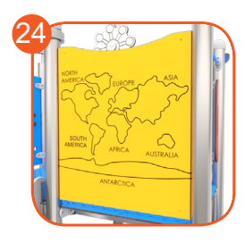
Milled educational board made of HDPE board with a thickness of 15 mm. It focuses attention and enables learning the basics of geography.