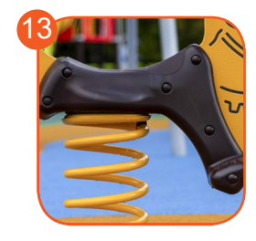
Ergonomic seat made of injection molded polyamide.