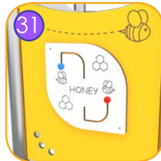
31 Module, which allows to move shapes on the milled tracks. Corrects visual-motor coordination. Made of 15 mm HDPE plates.