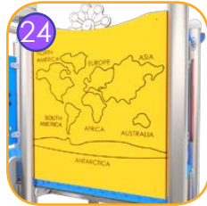
24 Milled educational board made of HDPE board with a thickness of 15 mm. It focuses attention and enables learning the basics of geography.