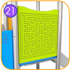
21 Milled educational board made of 15mm HDPE plate. Stimulates children senses.