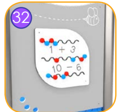
32 Module, which allows to move shapes on the milled tracks. Corrects visual-motor coordination. Made of 15 mm HDPE plates.