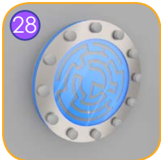
28 Rotary module, which allows to move the ball in the maze, made of HDPE plate, safe polycarbonate and stainless steel. Stimulates the sense of sight, the sense of space and teaches control of children energy.