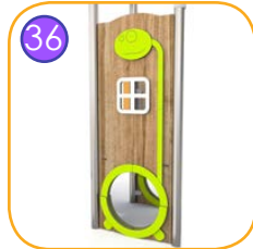
36 Passage module is made of 13 mm thick wood-like HPL, white and green 15mm HDPE boards and safe 8 mm thick polycarbonate.