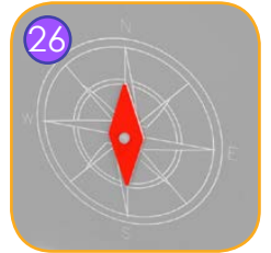
26 Milled educational board made of 15 mm thick HDPE board with a movable rotating element. It stimulates the senses and supports the development of children motor skills.