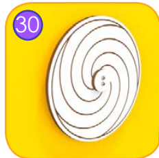
30 Rotary module, made of 13mm HPL plates. Stimulates the senses and supports the development of children motor skills. It stimulates the sense of sight and teaches control of children energy.