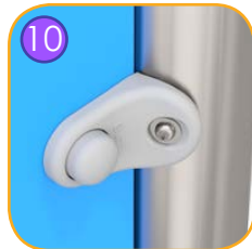
Plate and rope connectors made of injection molded polyamide.

Safe pipe plugs made of injection molded polyamide.