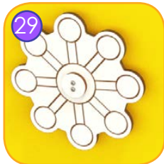
29 Rotary module, made of 13mm HPL plates. Stimulates the senses and supports the development of children motor skills. It stimulates the senses and support the development of children motor skills.