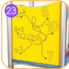
23 Milled educational board made of 15mm HDPE plate. Stimulates the sense of sight and focuses attention.