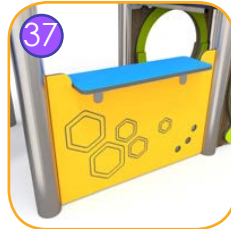
37 Counter module made of 15mm HDPE plate.