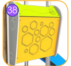
38 Balcony module made entirely of 15mm HDPE plate.