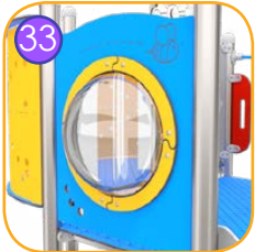
33 Hemispheric window with a diameter of 400 mm. Material: heat - formed polycarbonate 5 mm thick, resistant to vandalism.