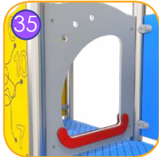
35 Passage module made of 15mm HDPE plate.