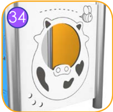
34 Milled educational board made of 15mm HDPE plate. It stimulates children senses and focuses attention.