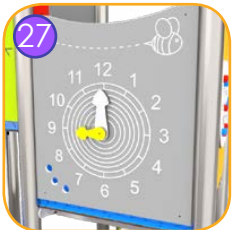
27 Milled educational board made of 15 mm thick HDPE board with a movable rotating element. Stimulates senses of sight, touch and focuses attention.