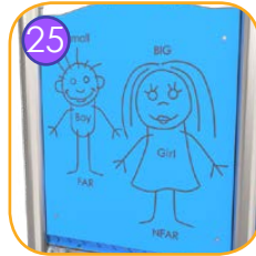
25 Milled educational board made of 15mm HDPE plate. It focuses attention.