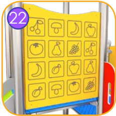
22 Milled educational board made of 15mm HDPE plate. Stimulates the sense of sight and teaches fast decision making.