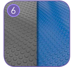
Anti-slip 18 mm HDPE plate. Very high resistance to weather conditions and attrition.