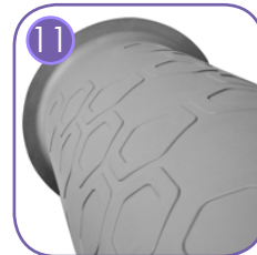
Tube made of LDPE polyethylene rotationally molded with the inner diameter of 53.3 cm and the length of 125 cm.