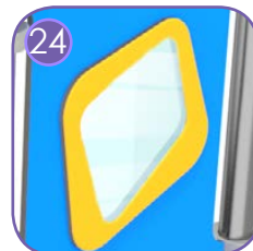
The windows are made of safe polycarbonate 8 mm thick.