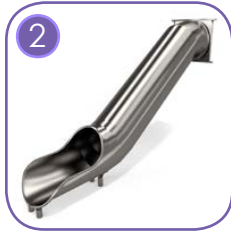
Tube slide made of stainless steel AISI 304. The metal sheet is 2 mm thick and the end section is finished with a band made of pipe 33.7 mm. The surface is polished.