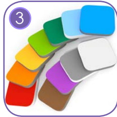
Plates of the walls made of colourful triple layered 15 mm HDPE polyethylene, in the highest quality, totally damp-proof and resistant to UV.