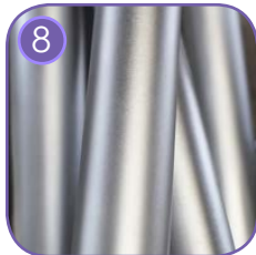
Solid construction made of stainless steel AISI 304 totally resistant to weather conditions.