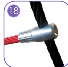
Rope ends pressed in a sleeve made of durable aluminum alloy.