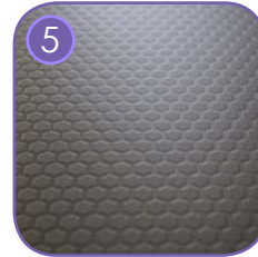
Anti-slip anthracite 10 mm HPL platform plate with a very high resistance to weather conditions and attrition.