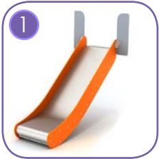
Slides made of stainless steel AISI 304. Metal sheet with a thickness of 2 mm formed in a CNC technique. Side panels made of HDPE polyethylene 15 mm, in the highest quality and totally damp-proof and resistant to UV.