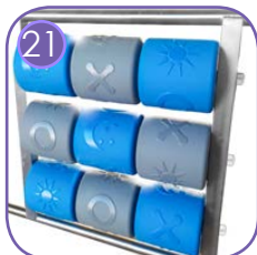
The TIC TAC TOE game is made of polyethylene rotationally molded with symbols on the form. Esthetic finishing without sharp edges. The barrel is 16 cm height and 15.5 cm wide enriched with additional symbols like sun and moon, making the fun even better.