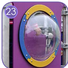
Hemispheric window with a diameter of 400 mm. Material: heat-formed polycarbonate 5 mm thick, resistant to vandalism.