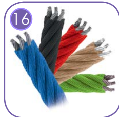
Polypropylene ropes pp-multi-split type with a steel core and a diameter of 16 mm.