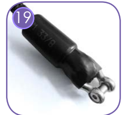
Ends of ropes clamped in sleeves made of durable aluminum alloys.