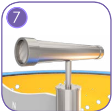
Spyglass module made of AISI 304 stainless steel and safe polycarbonate.