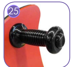
Handhold made of injection molded polyamide.