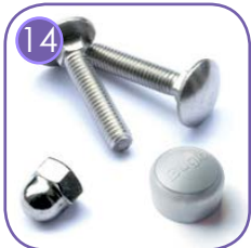
Connecting elements like screws, nuts, washers made of stainless steel. Vandal-proof screw plugs made of injection molded polyamide.