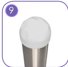
Safe pipe plugs made of injection molded polyamide.