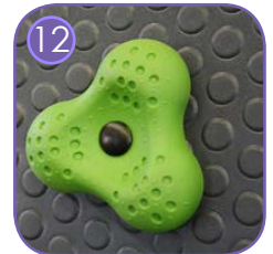
Climbing rocks made of chippings and colourful polyester resin.