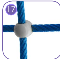
Solid and esthetic rope connectors made of injection molded polyamide.