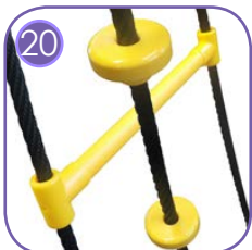
Rope ladder steps and rope knots made of injection molded polyamide.