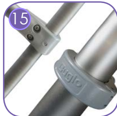
Patented system of connectors and clamps made of strong aluminum alloy. Aluminum is secured by the process of electrophoresis and powder coating with polyester paint UV resistant and QUALICOAT attested.