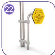
Telephone module, made of triple layered 15mm HDPE and stainless steel. Two modules allow distance communication.