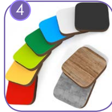
Plates of the walls and platforms made of colourful 13 mm HPL (black plates made of 8 mm HPL), in the highest quality, totally damp-proof and resistant to UV.