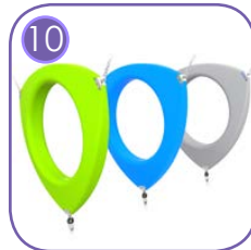
Ergonomically-shaped polyethylene rings improving the physical well-being and motor coordination.